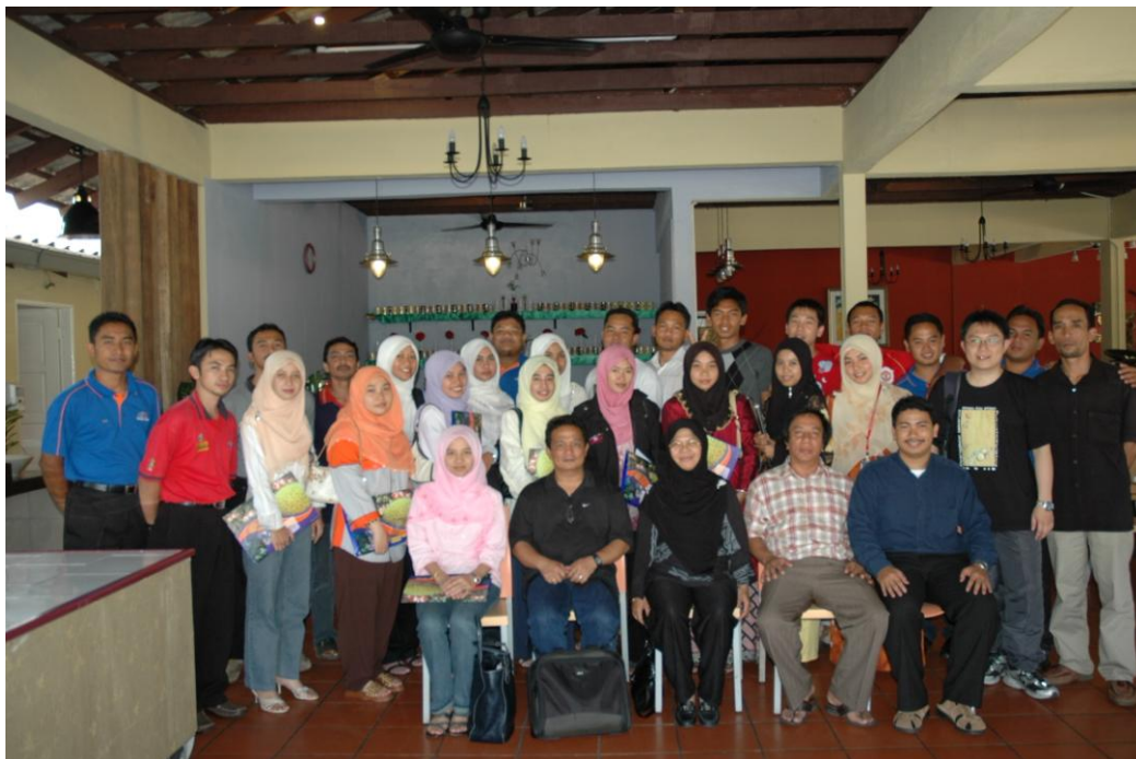
AKUATROP staffs during AKUATROP Retreat at Rumbia Resort Villa, Paka.

As a conclusion, it is hoped that future AKUATROP Retreat organized workshops would be better and it would assist in developing aquaculture research in UMT and nationwide.