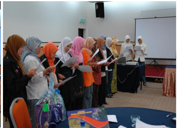
Sing a “soul” song is one of the activities have been done as the “ lestar ” teamwork building among the AKUATROP staffs.