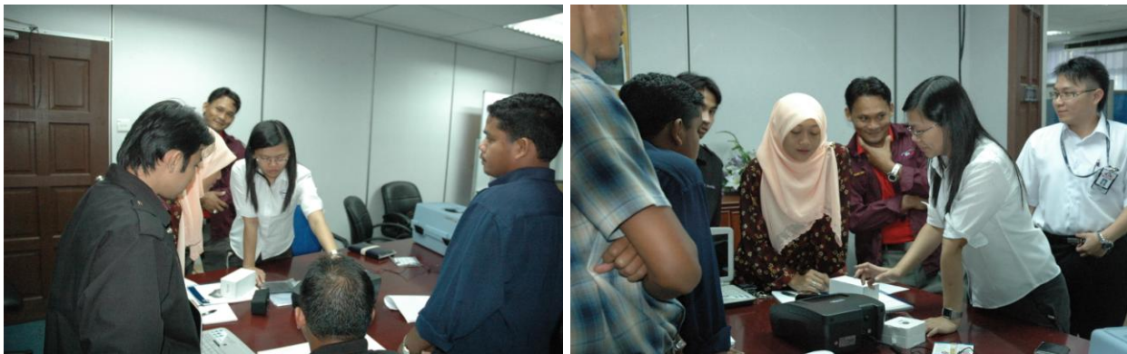
AKUATROP staffs learned how to handle Portable Spectrophotometer and Multiport System (YSI 556) in a proper ways from demonstrators.

The objectives of this workshop is to demonstrate to all the participants of this program in how to handle such machine in a proper ways so that the risk of the machine to be broken can be decreased and also to demonstrate how to handle a right way in calibrates this devices before and after using them. These calibrations are important in maintaining the machine accuracy when logging data to its memory. The modulators are from ARACHEM which are expertise about these devices. Overall, this workshop works smoothly and successfully with the full cooperation from all the officers and participants involved.