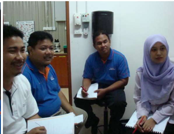
AKUATROP staffs pay attentions during the Water Analysis Workshop.