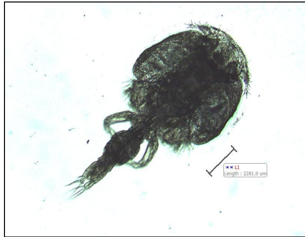
Caligus sp. the external parasite on seabass ( Lates calcarifer )