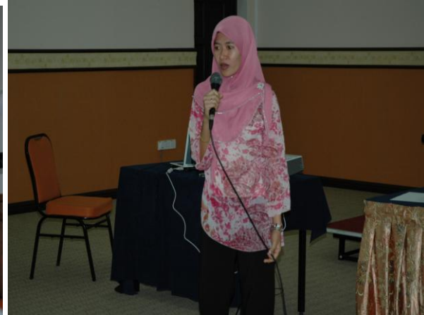
During the retreat every staffs was given a chance to give their opinion in order to improve the AKUATROP future performance.