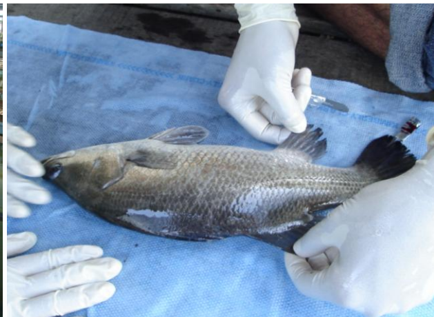
Live seabass was caught (left) then parasites examination was carried out.